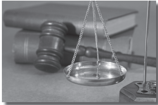
Ethical/Legal Issues and Documentation